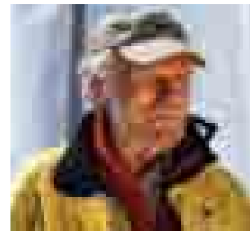
As the sailor in later years.