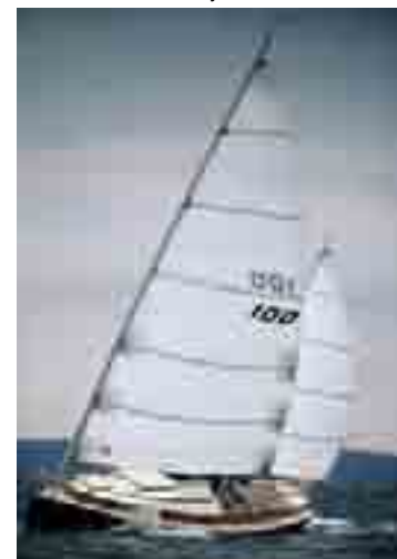
The catalyst for our friendship. Sailing Norwalk Islands Sharpies.